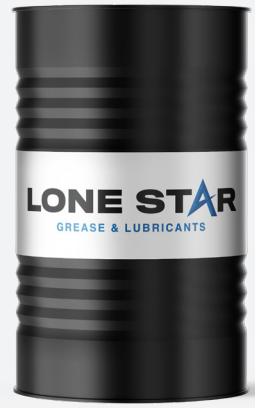
Drums 400 lbs.

*Custom and Bulk Packaging available upon request.