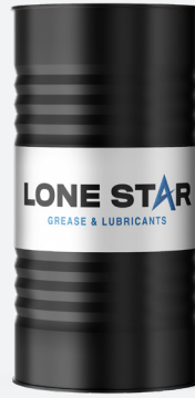
Kegs 120 lbs.