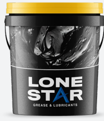
Pails 35 lbs.