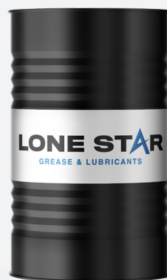
Drums 400 lbs.

*Custom and Bulk Packaging available upon request.