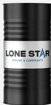
Kegs 120 lbs.