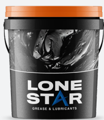
Pails 35 lbs.